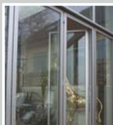
System SF70 tilt and turn panel within folding sliding doors