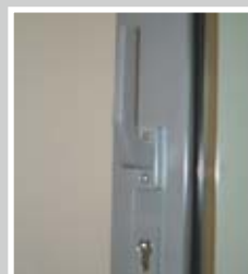
Lever handle with key lock below