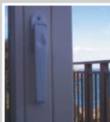
Flush door handle